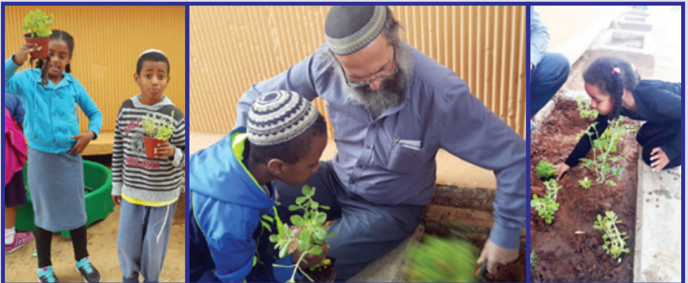
On Good Deeds Day at the Abir Yaakov School in Yavne, Limudiah children and teachers and bankers from Bank Hapoalim plant seedlings to start a fragrant garden of herbs and flowers.

It's you who provide the wonderful program where Good Deeds happen every day for the Limudiah children. Thank you. ■