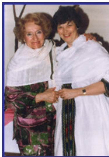
Ruth and me at a NACOEJ event years ago.

It seems impossible now, but the first time I spoke with Ruth Gruber, I had never heard of her. She was just a voice on the telephone, telling me she was a journalist who wanted to visit Jews in Ethiopia, and had heard about NACOEJ missions. Could she join one?