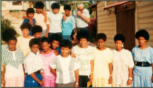
In the 1980's, NACOEJ funded continuing education and vocational training for immigrant girls.