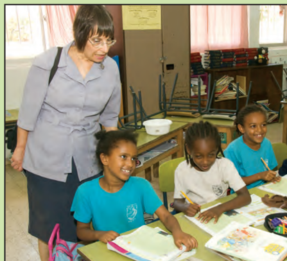
NACOEJ runs after-school education for Ethiopian children in 20 schools in seven Israeli cities.