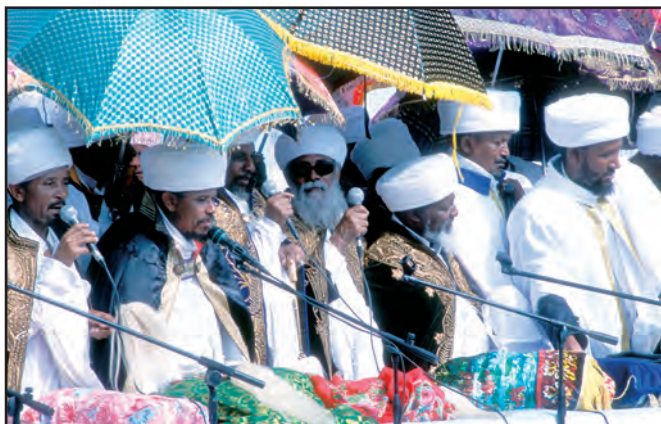
Protected from the Jerusalem morning sun by traditional parasols, Kesotch chant the beautiful Sigd liturgy while fasting with the community.