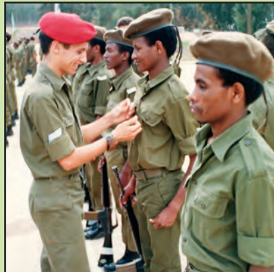
Ethiopians excel in the IDF.