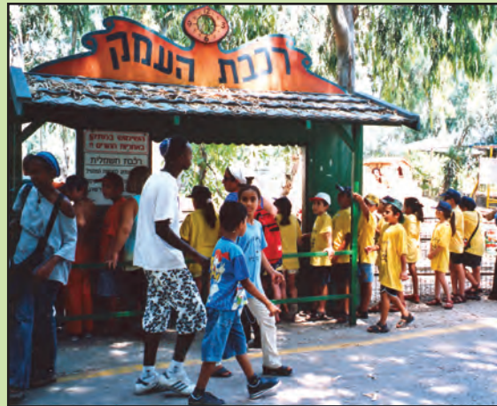
LEFT: Summer school/camp offers fun and learning.