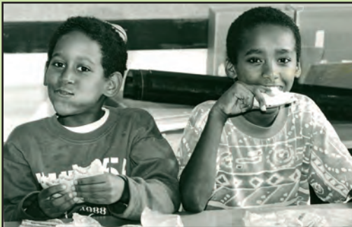
ABOVE: Kids need school lunches in Israel too.