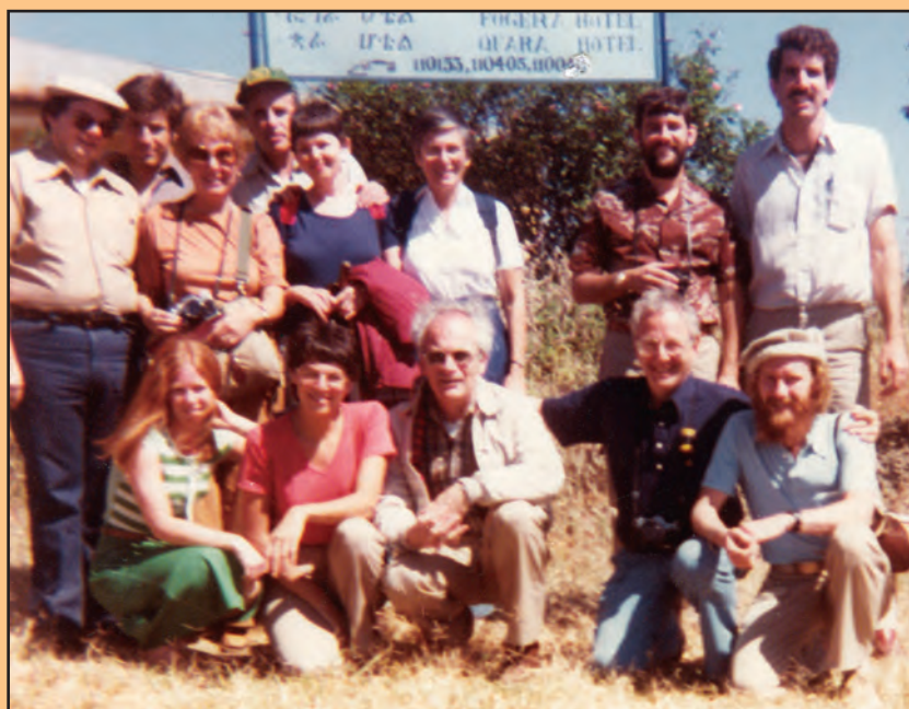
Late in 1981, the first American Jewish mission to Ethiopian Jews, sponsored by the Los Angeles Jewish Federation, landed in Gondar. In early 1982, NACOEJ was formed in New York. Five mission participants are still NACOEJ Board members.