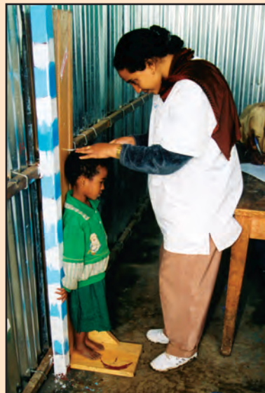
A compound nurse checks all children regularly.