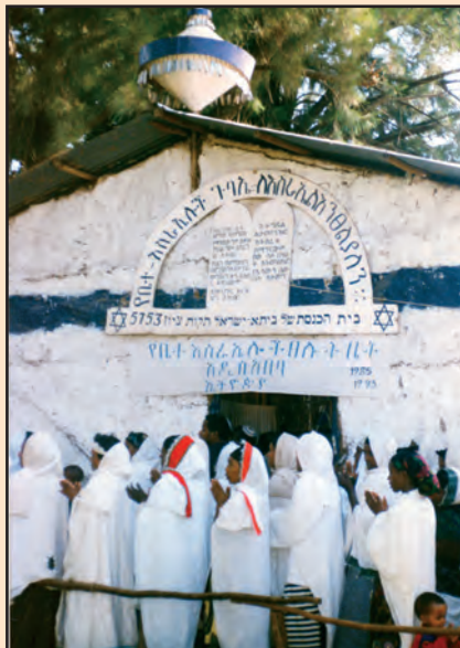
RIGHT: Tiny synagogues in Beta Israel compounds grew into big spaces for worship, work and learning.