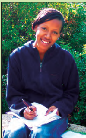
LEFT: NACOEJ sponsors high school students in Israel.