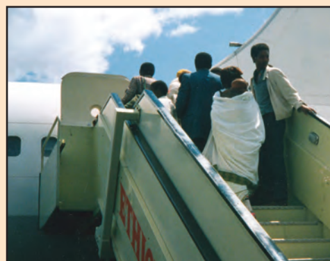
Ten years later, NACOEJ staff helped Operation Solomon fly over 14,000 Jews to Israel.