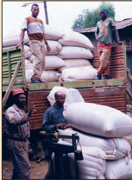
RIGHT: Today, monthly food distributions to Jews in Gondar enable families to survive.