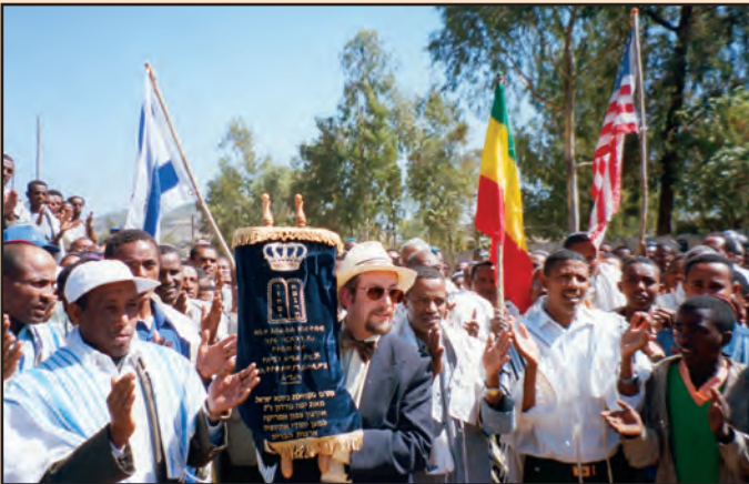
ABOVE: Joyful processions greet donated Torahs, carried to Ethiopia by NACOEJ missions. Flags of Ethiopia, Israel and the United States are displayed.