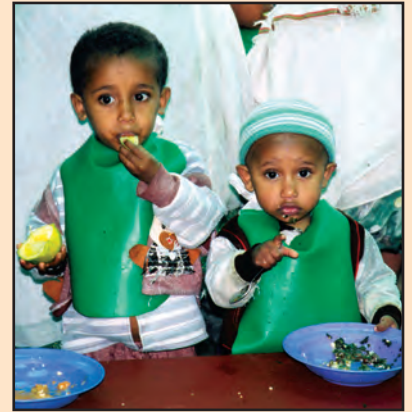
Children eating in the Center grow healthier, taller and stronger.