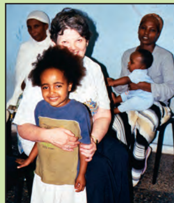
LEFT: We spent time in bomb shelters with Ethiopian Jews during the Second Lebanon war.