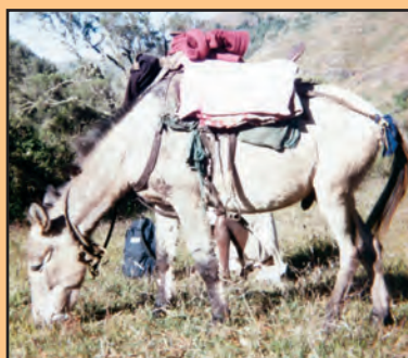
Mission members rode mules and horses, hiked, and slept on the ground to reach a remote Jewish village in the mountains.