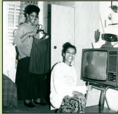
TV helps immigrants learn Hebrew.