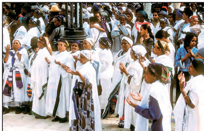
Robed in white, Ethiopian-Israeli women hold their hands out prayerfully at the Sigd in Jerusalem. All will break their fast when Sigd ends in the afternoon.