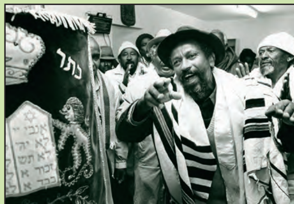
Torahs come to Ethiopian-Israeli synagogues via NACOEJ. The one above, in BeerSheva, was the first.