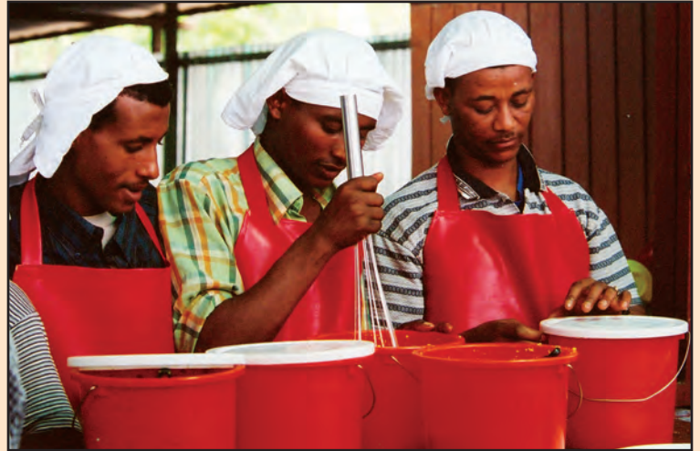
A Feeding Center serves nutritious twice-daily meals to thousands of young children, pregnant and nursing mothers.