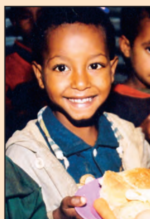
LEFT: Schools and lunch programs were opened for the children.