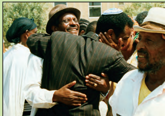
New arrivals joyfully greet family in Israel.