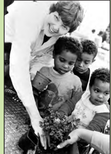
ABOVE: NACOEJ pre-school program after Operation Solomon.