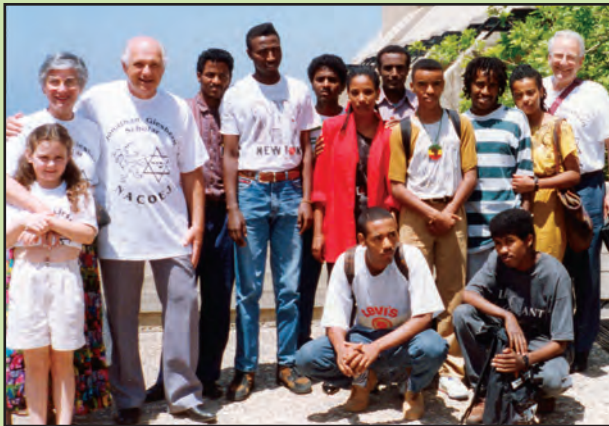
Leadership training at Leo Baeck is funded by NACOEJ.