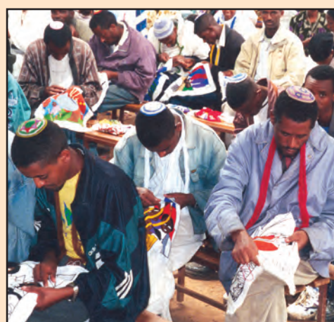
ABOVE: An embroidery co-op, funded by NACOEJ, gave work to thousands left behind.