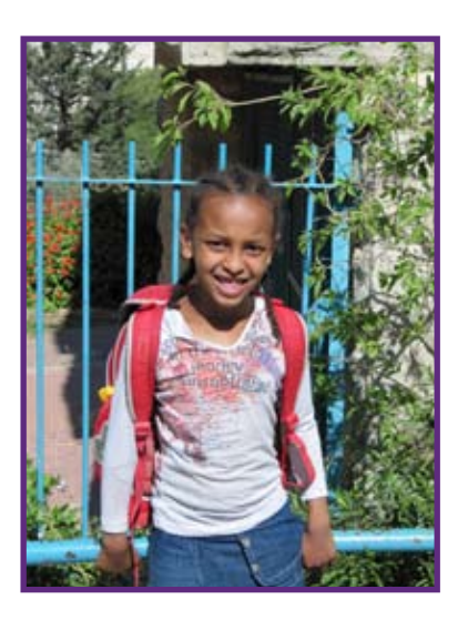
A student about to enter the Brandt School in Jerusalem, where NACOEJ has opened its newest Limudiah.

The global economic crisis continued to pose challenges to NACOEJ's Limudiah program in 2009-10. As in the 2008-09 school year, we served about 300 fewer students than in the period prior to the recession. Despite this, we were able to secure funding to open the new Jerusalem Limudiah, at the city's request, underscoring the continued recognition of the program for its long-term effectiveness and impact on Ethiopian-Israeli students.