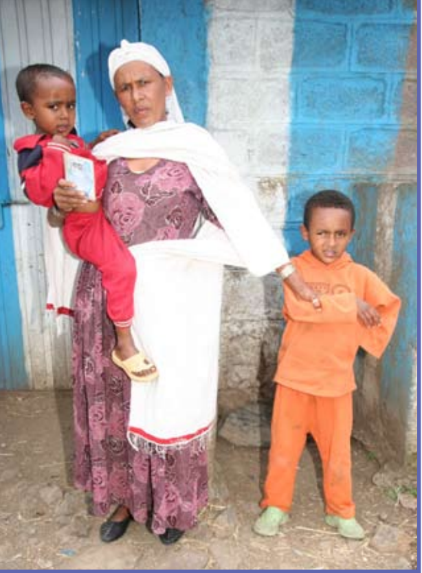
A member of the Beta Israel community waits to make Aliyah with her children.

Intensive negotiations with the Prime Minister's office have been going on all year to obtain a government resolution that would provide for the inspection of the remaining 7,700 Beta Israel remaining in Gondar and bringing those possessing the requisite maternal lineage. NACOEJ representatives have made numerous trips to Israel in connection with these discussions which have taken place between representatives of the Prime Minister's office, NACOEJ, the Jewish Agency for Israel, the Chief Rabbinate, the Public Committee for Ethiopian Jewry (headed by Justice Shamgar), members of Knesset and community representatives. It is anticipated that the results of these negotiations should be known in the relatively near future.